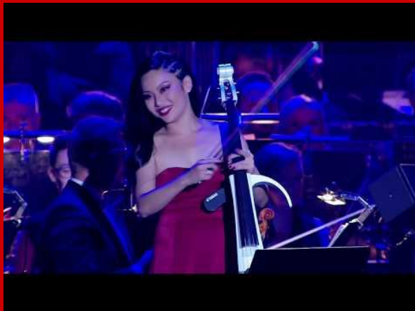
The amazing Tina Guo and the symphonic Phantom Doctrine Suite