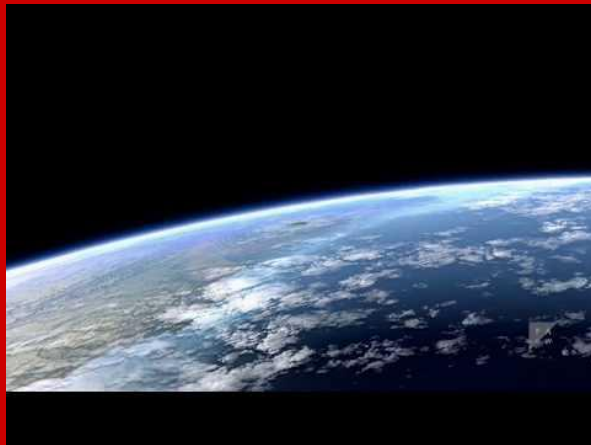
Wrapped – Berlin International Film Scoring Competition