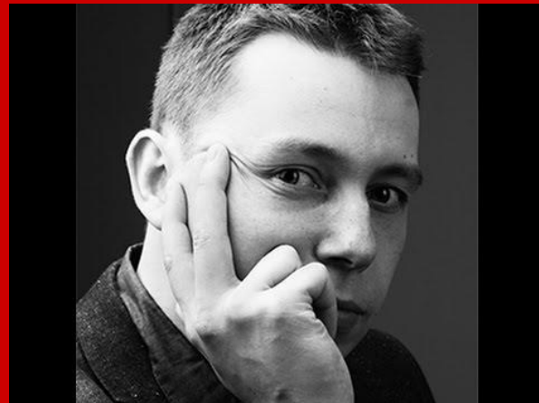
The winning Young Talent Award 2014 Suite